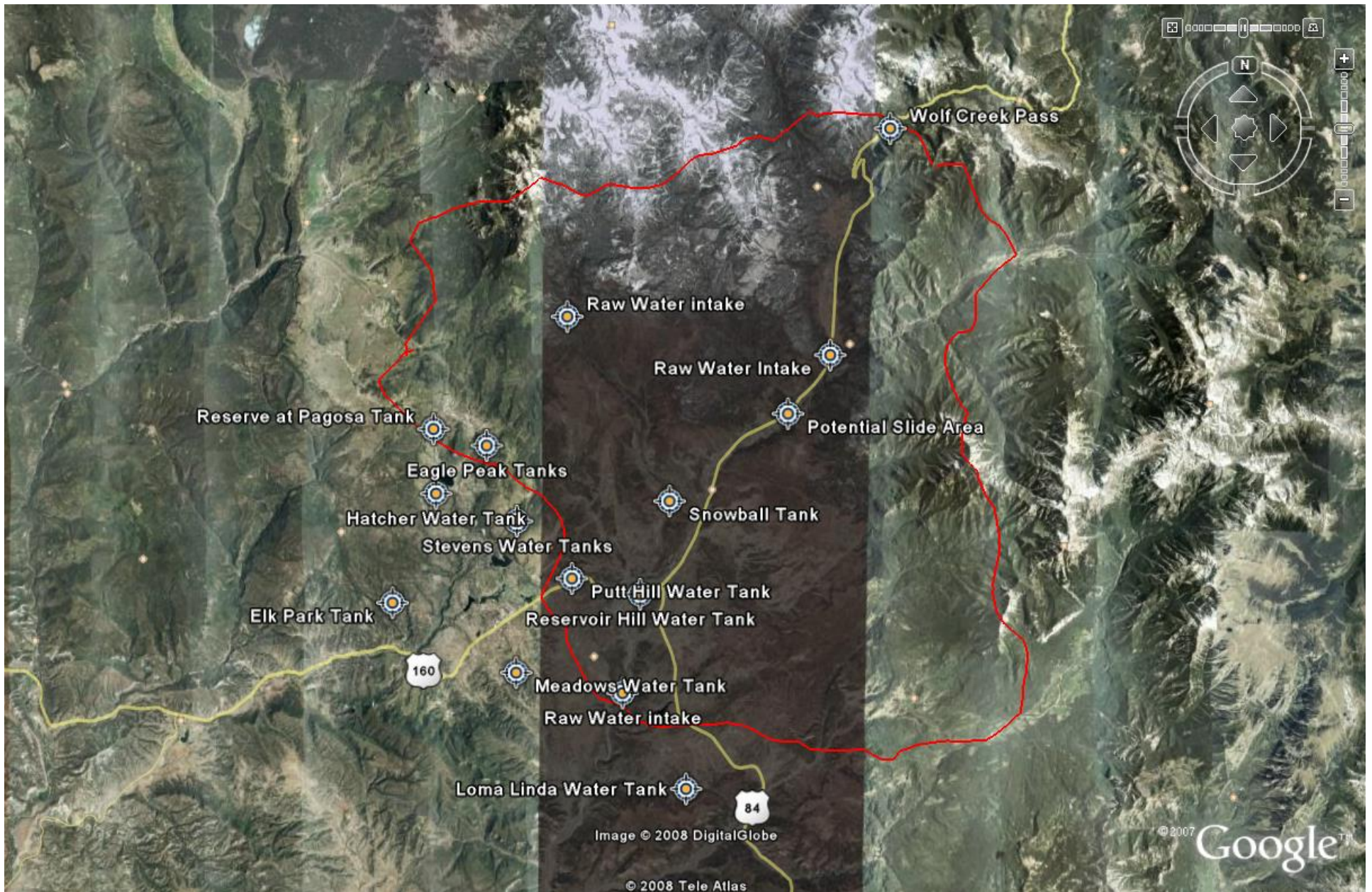
Generic watershed and potable storage facility map